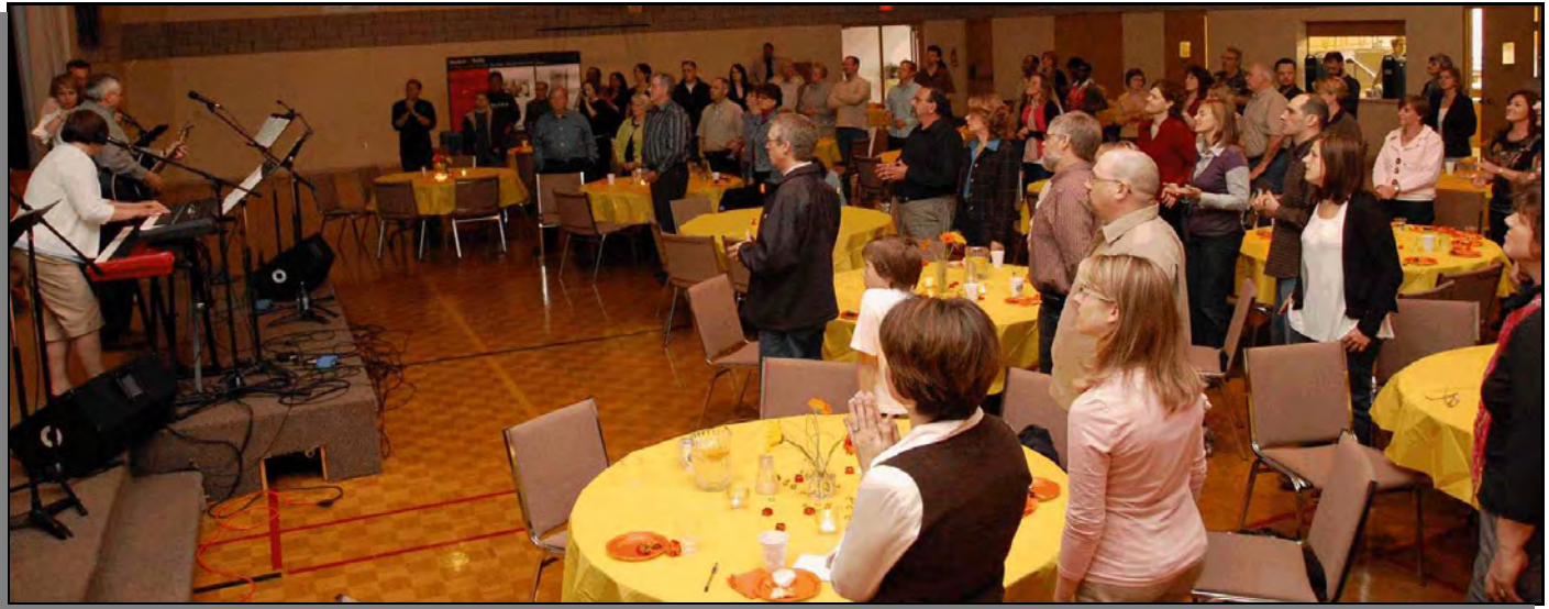
The muh Celebration Committee did an awesome job of the venue with flowers, sushi, fruit & veggie hors d'oeuvres.

sacrifice. The Biblical account has gaps, and we acknowledge that our human understanding does not fully comprehend God's story, but from Adam and Eve leaving the Garden of Eden through to the time of Moses we do see a nomadic people whom conversed